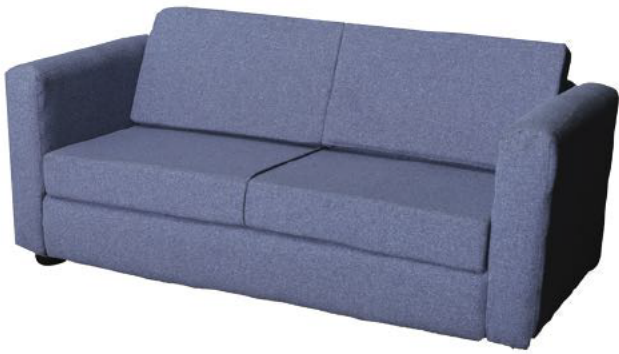
SABINA LOUNGE SUITE