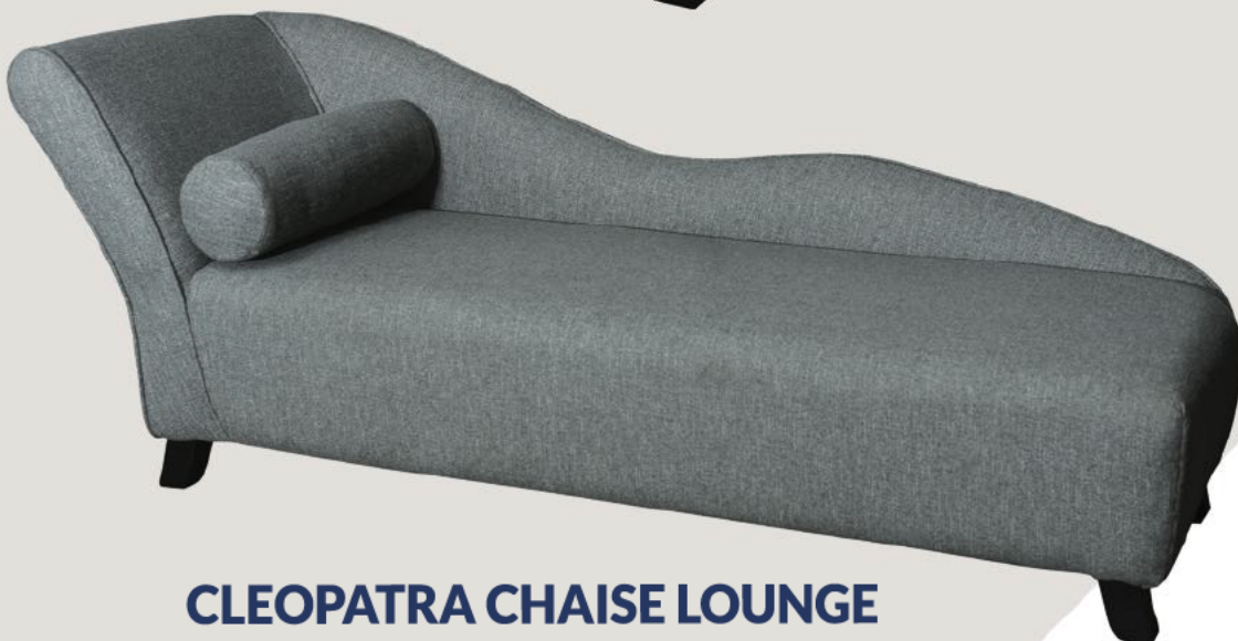
CLEOPATRA CHAISE LOUNGE