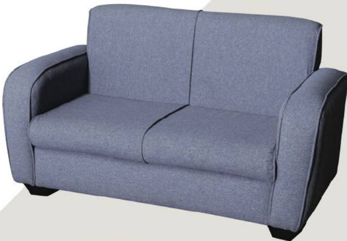
VENICE LOUNGE SUITE