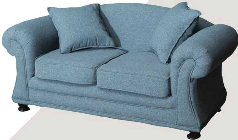
MIAMI LOUNGE SUITE