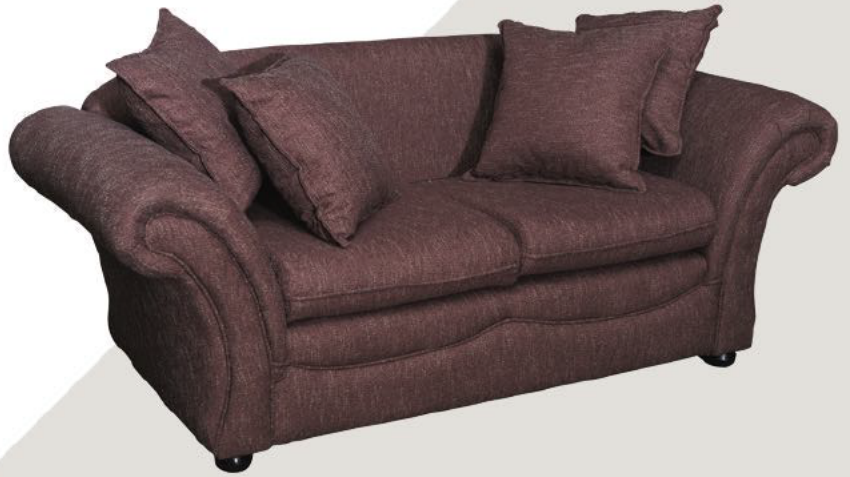
FLORENTINA LOUNGE SUITE