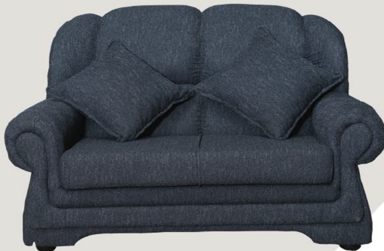
ALEXIA LOUNGE SUITE