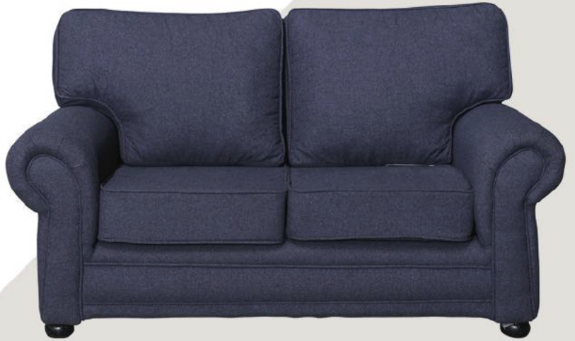
PASADENA LOUNGE SUITE