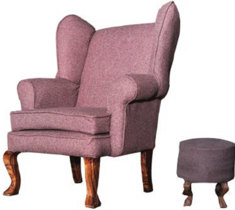
WING CHAIR WITH FOOT STOOL