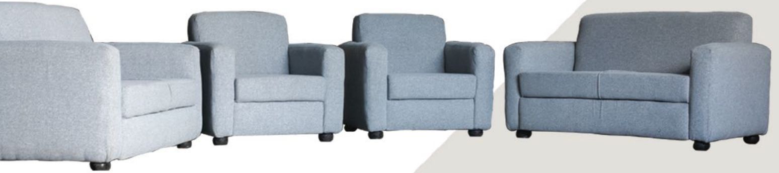
KENA LOUNGE SUITE